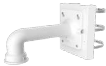
TD-YZJ0808+TD-YZJ0501 Pole mounting bracket