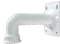
TD-YZJ0808+TD-YZJ0601 Corner mounting bracket