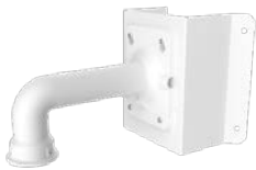
TD-YZJ0808 Wall mounting bracket